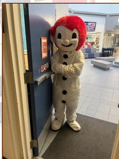
Bonhomme de Neige est ici!!

On March 20 th , I spent the morning at École Leduc Estates School taking part in their annual Carnaval. This event is the largest and oldest festival in the world, and originated in Quebec City and is celebrated annually. At Leduc Estates, there were several activities as part of Carnaval, including: scavenger hunts, colouring, maple taffy making, obstacle courses, curling, and others. Carnaval’s mascot, Bonhomme, also made an appearance.