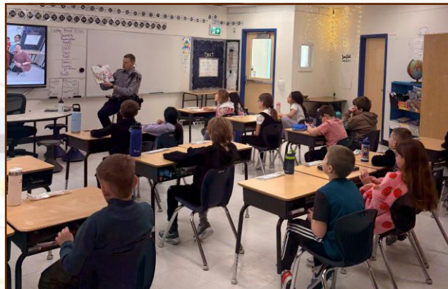
“Officer Buckle and Gloria” was enjoyed by the grade 3s.