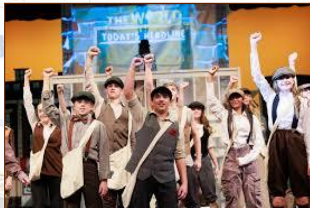
"Newsies JR" ran from March 18-19 at the Maclab Centre for the Performing Arts.