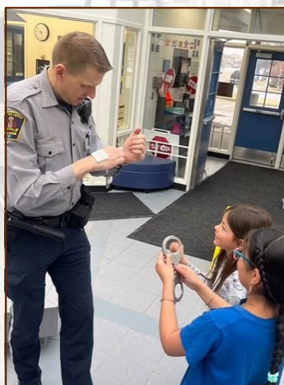
Taking a break from the scavenger hunt.