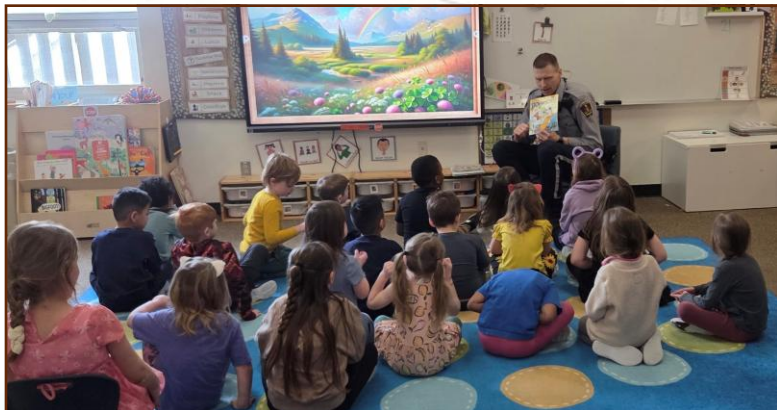
Reading “Bounce!” to Kindergarten students.

On March 13 th and 25 th , I attended Willow Park School to read books to various grades. One of the books was “Officer Buckle and Gloria” by Peggy Rathman, about an officer who tours around schools education students on safety tips. Another book I read was called “Bounce!” by Robert Munsch, about kids who are brought to the hospital and have too much fun messing around with a hospital bed.